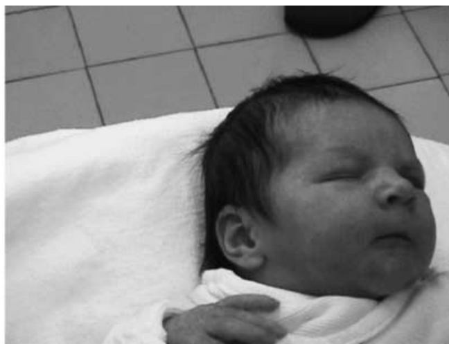
Figure 1b Mouth clutching.

Each infant was presented with two sounds: /a/ and /m/ . Each sound was presented in a soft and stable way, and lasted 4 seconds. The interval between sounds was 1 second. The experimenter made /a/ or /m/ successively for 4 times, which formed one trial. Each trial was 20 seconds long. The interval between trials was 25 seconds. If the infants were upset, or yawned, or sneezed, the time between trials was longer since the experimenter waited until the infants had calmed down. Twelve of 19 infants received the stimuli with the order /m/ – /a/ ; the remainder ( n = 7 ) received the reverse order. Each infant was presented with 8 trials for each condition. Nine infants received additional trials because during the experiment they were upset or tired. The trials in which the infant was not in the appropriate status were excluded from future analysis. In the final analysis, each infant had 8 trials for each condition. The process of the experiment is shown in Table 1.