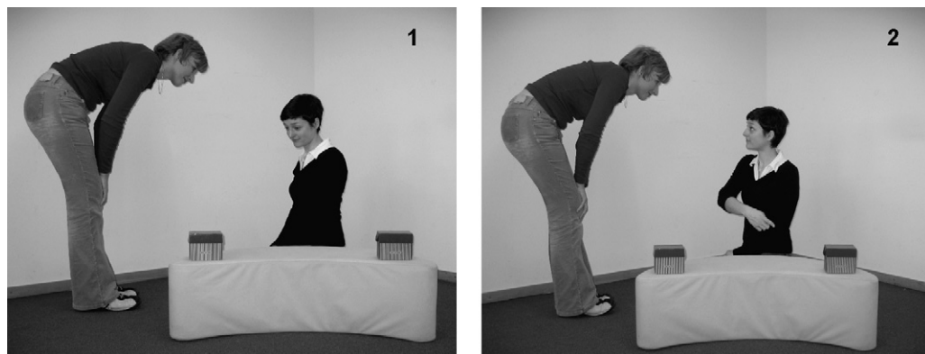
Fig. 2. Examples of the communicative cues in the experimental condition: (1) ostensive gaze alone to the left container, (2) pointing with gaze gesture to the right container.

and sufficiently far apart that the infant later could not open both containers simultaneously. E then announced to E2 that she had hidden the toy, upon which E2 lifted her head and opened her eyes. E immediately started to give one of two deictic cues to E2: