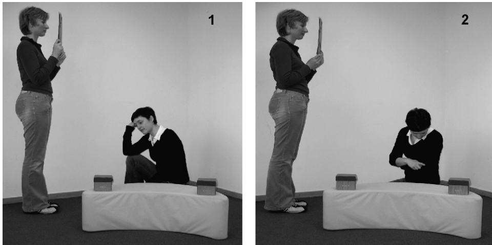
Fig. 3. Examples of the similar-looking but non-ostensive cues in the control condition: (1) absent-minded gaze alone to the right container, (2) outstretched index finger with gaze to the left container.

Control condition – Non-communicative ‘pointing’ with gaze. E stretched out her index finger as in the experimental condition, but rested her hand on her knee or her other arm. For the rest of the trial, she pretended to examine her outstretched index finger. While doing this, E occasionally alternated gaze non-ostensively between E2 and the correct container and called E2’s name. Fig. 3 depicts an example of each similar-looking but non-ostensive cue in the control condition.